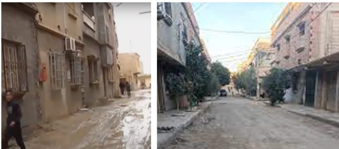
Figure 3. Some places in the neighborhood before the intervention.

The scheme guide, which took the form of design proposals and law-financial recommendations got its way to implementation even partially at the time of writing this paper.