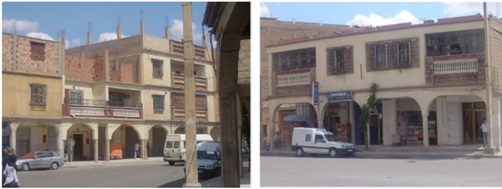
Figure 4. Some places in the neighborhood after the intervention.